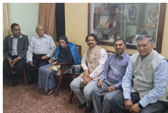
Honoring Justice (Retd) K S Puttaswamy An icon of privacy in India