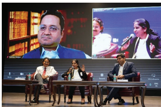
Indian Data Protection Summit Emerging Technologies & Privacy