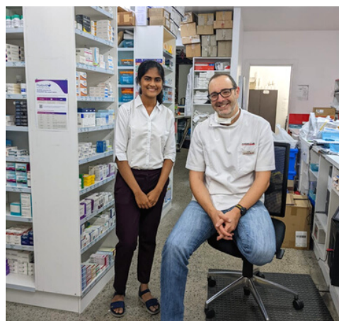
With the chief pharmacist

You can apply online for the Australian visa, which is a convenient option. If you have your passport already and have kept your documents in order, the visa process should take about two weeks. I applied for a student visa which granted me eligibility for the mobility program as well as to obtain government funding. The communication from the University was quite clear and the entire process was fairly seamless. The key for any successful visa application is to gather all the necessary documents and fill in the details carefully and accurately. Alternatively, applying through an agent might make the process easier for you. Since I was posted in a community setting, I had a few mandatory health examinations to clear, and I was required to take certain vaccinations as well. Once completed, I had to submit the related documentation to the University.