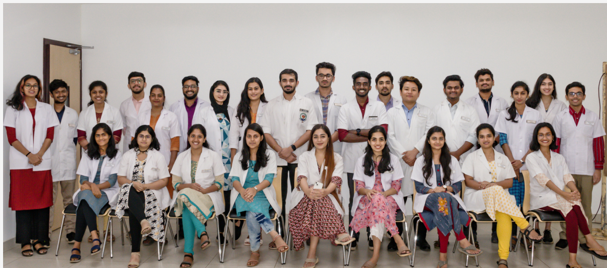
PHARM D 2017/2020 TO 2023