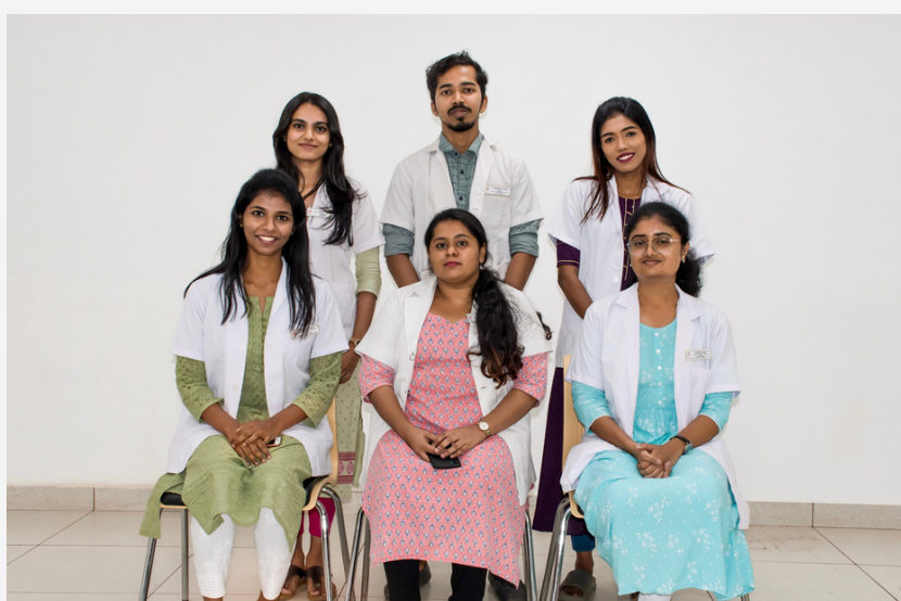
M PHARM (Pharmacy Practice) 2021 to 2023