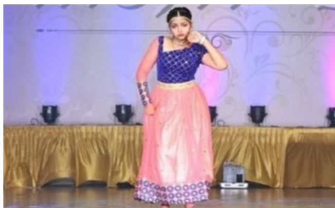
Eastern Dance Solo