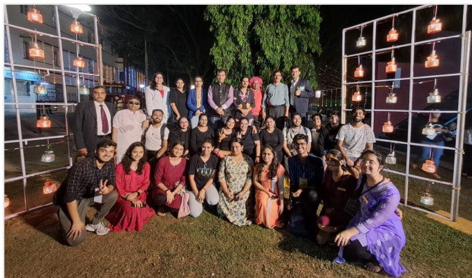
Staff Variety Entertainment Team