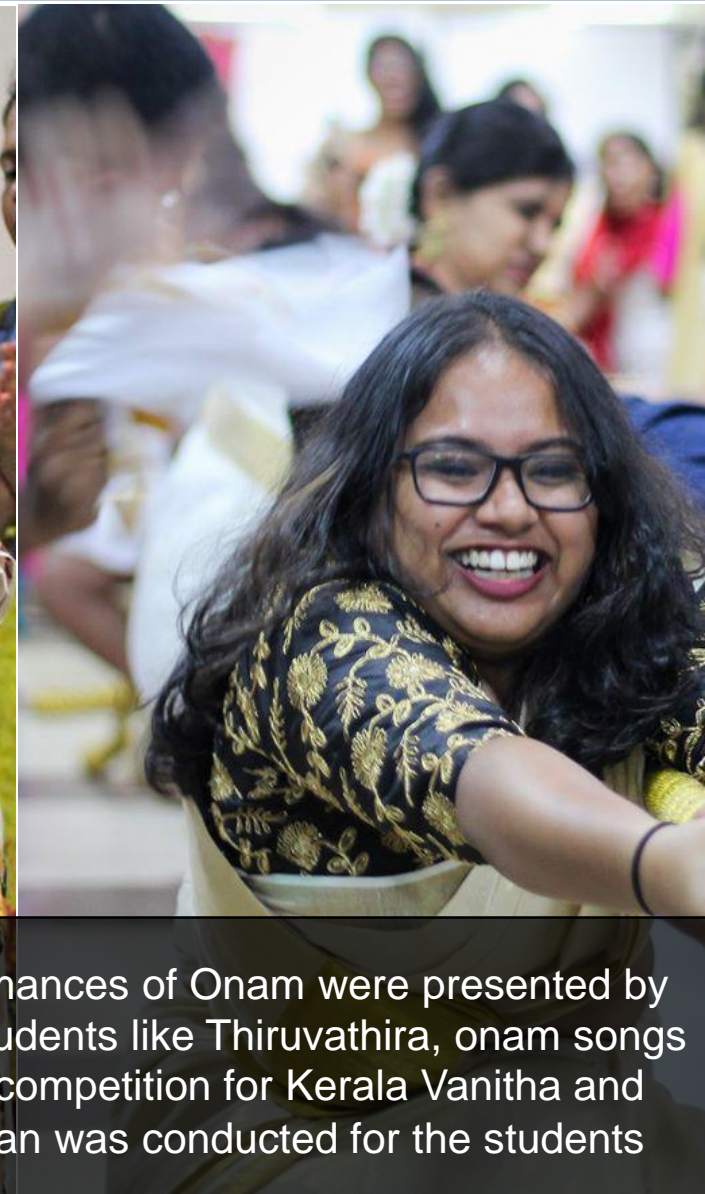
Cultural performances of Onam were presented by various batch students like Thiruvathira, onam songs and dance. A competition for Kerala Vanitha and Kerala Sreeman was conducted for the students