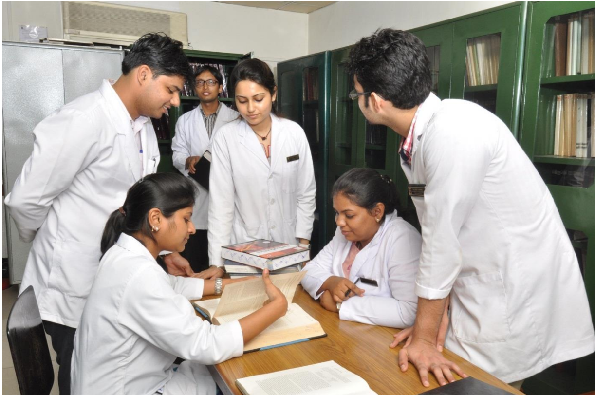
Air conditioned Reading Rooms