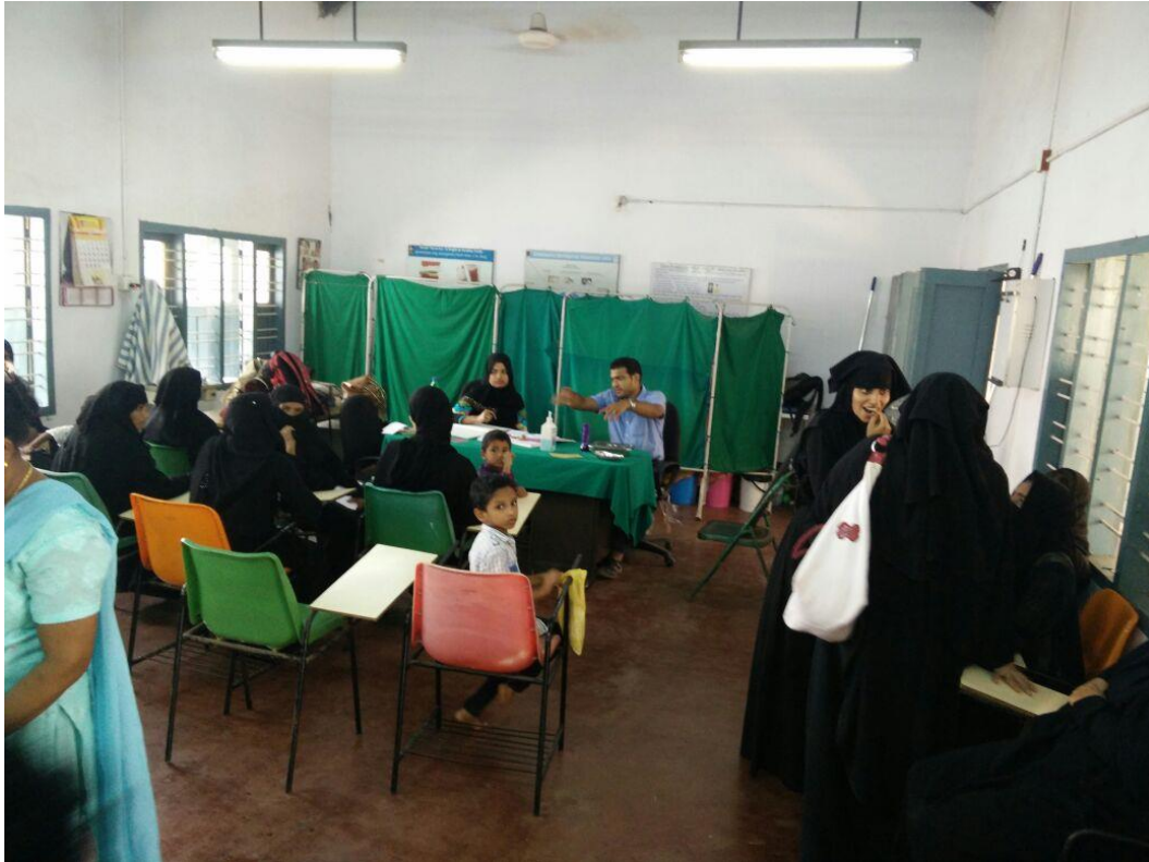
Community Outreach Program