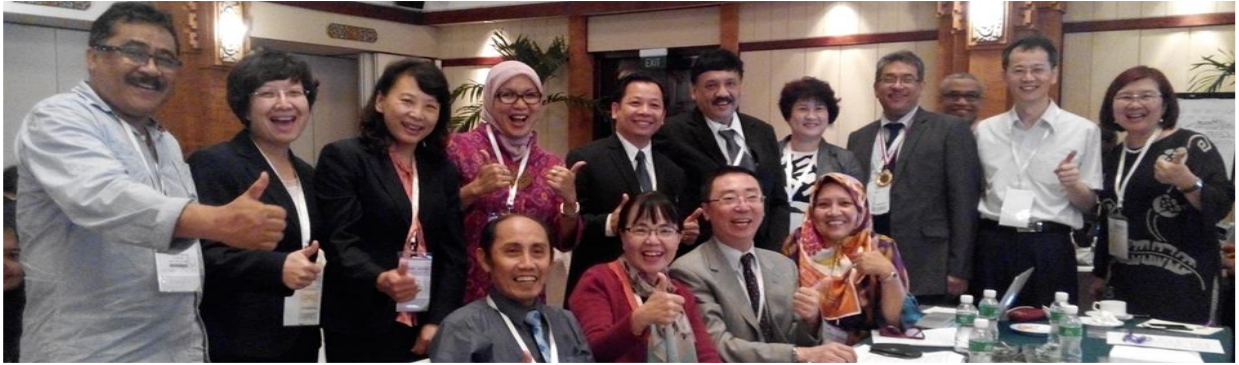
SEEADE Dean's Meeting in Bali, Indonesia