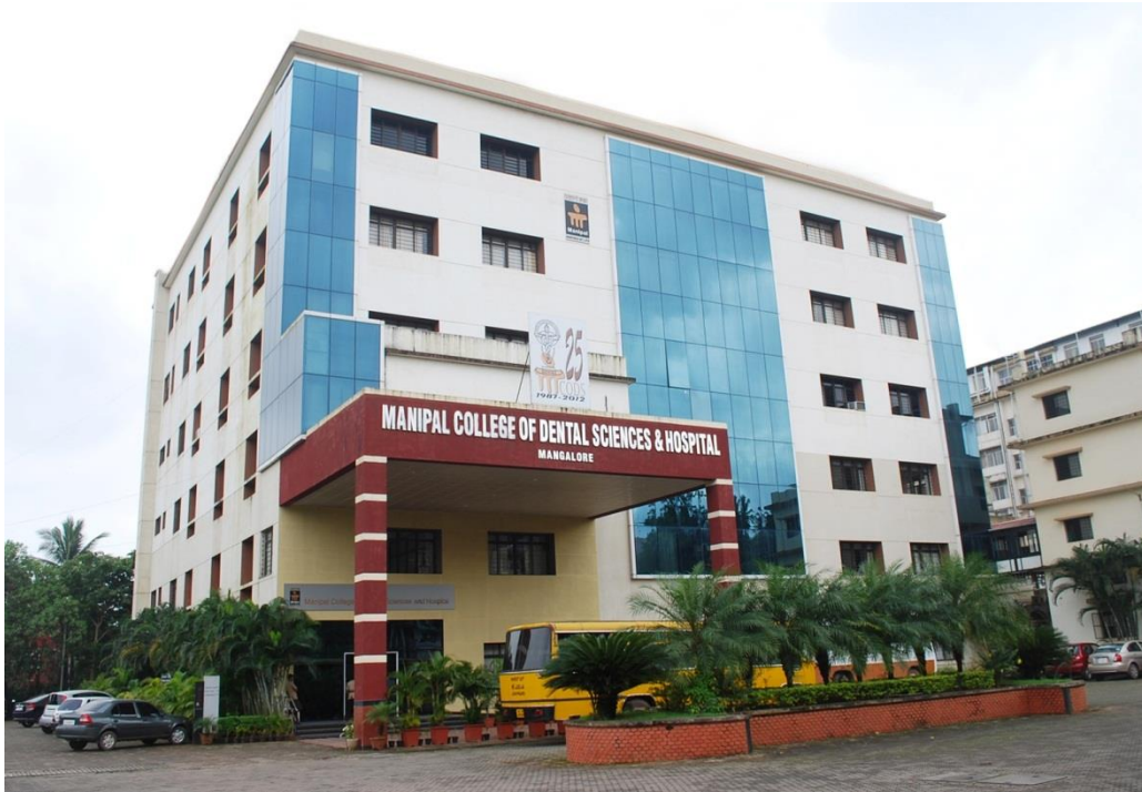
Manipal College of Dental Sciences, Mangalore