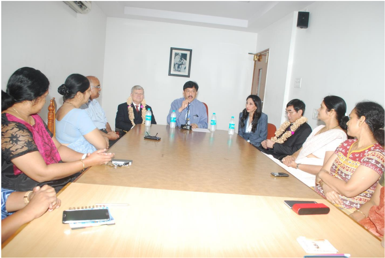
Preliminary meeting for Student Exchange Program with Boston University