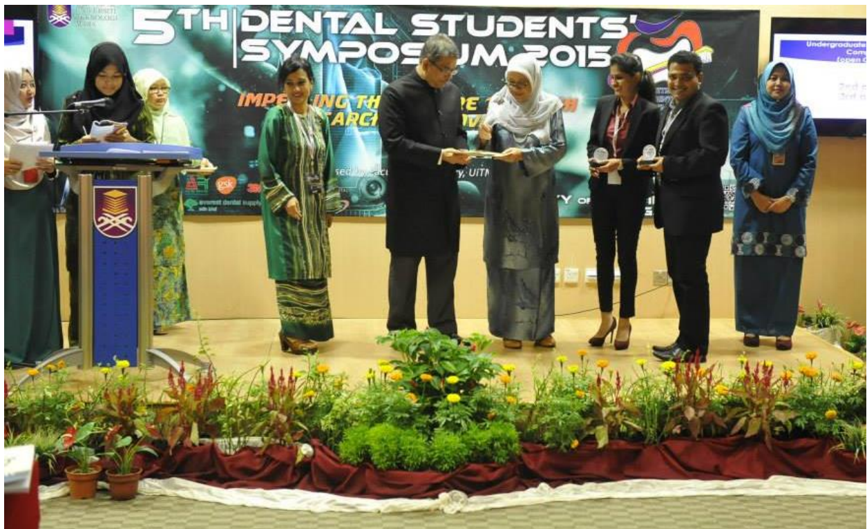
Student Exchange Program with Universiti Teknologi Mara, Malaysia