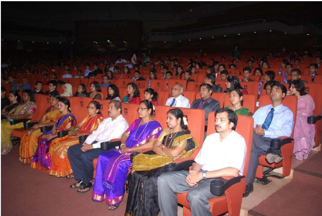
Air conditioned Auditorium and Conference Hall