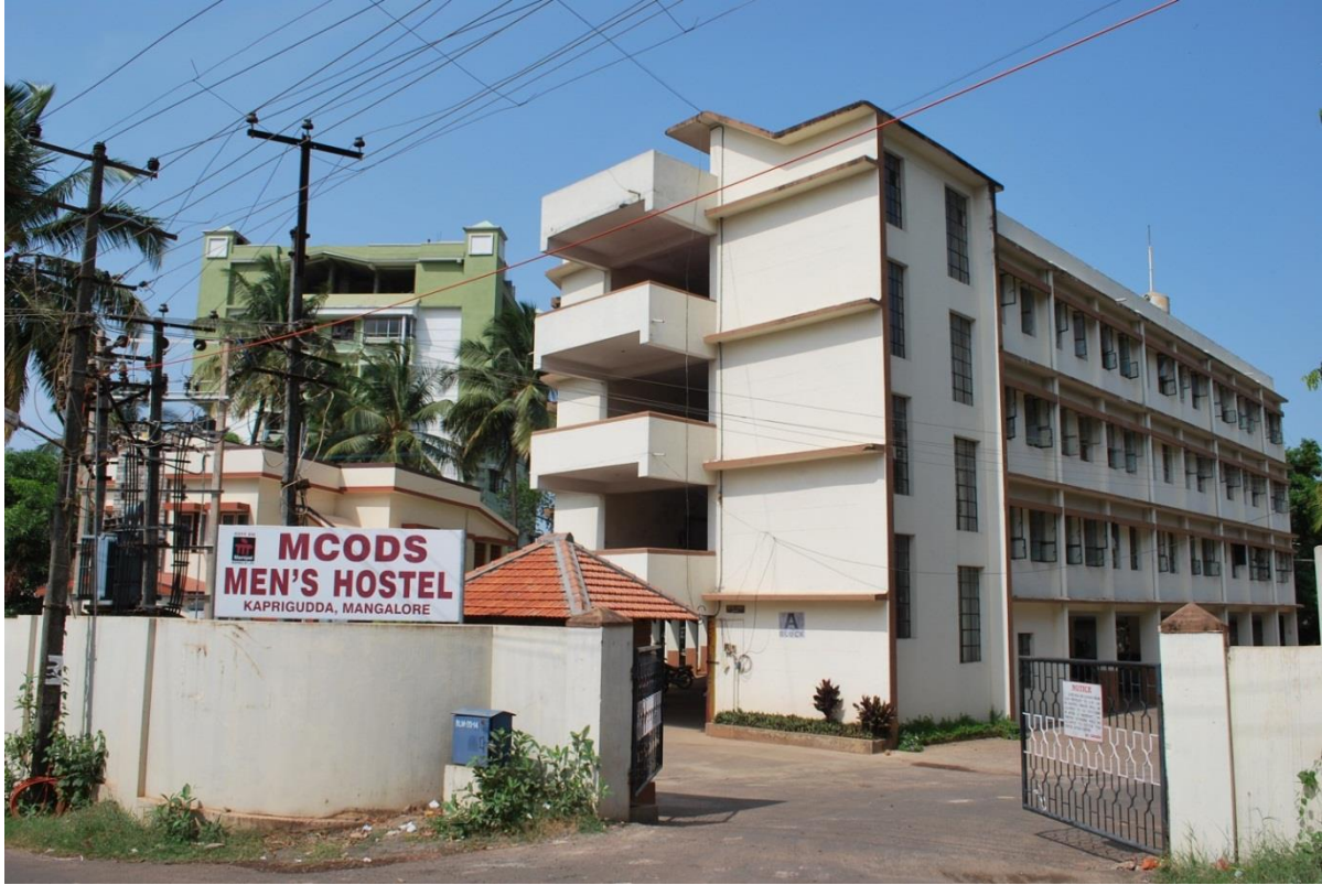
Hostel Facility for Boys