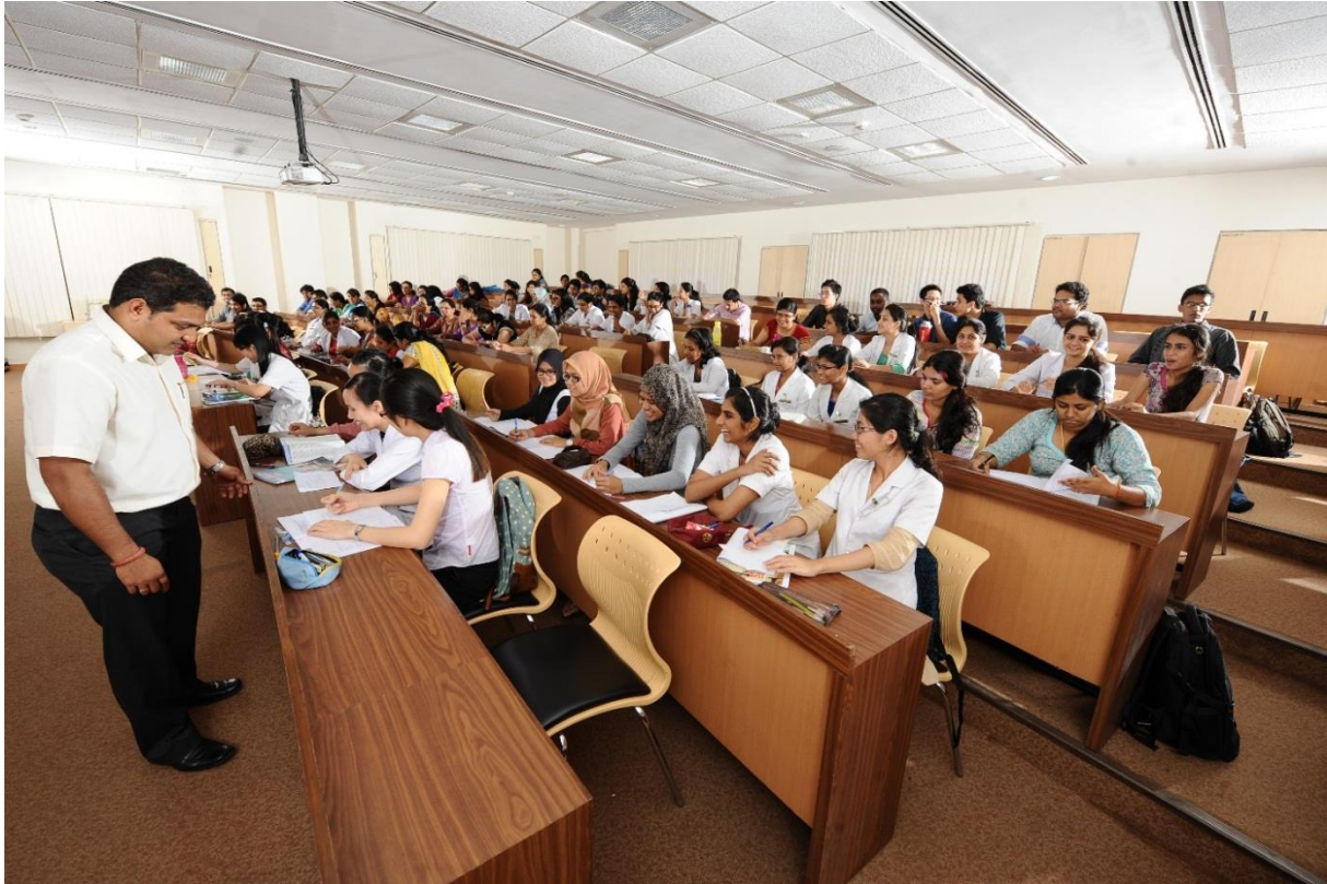
Air conditioned lecture class