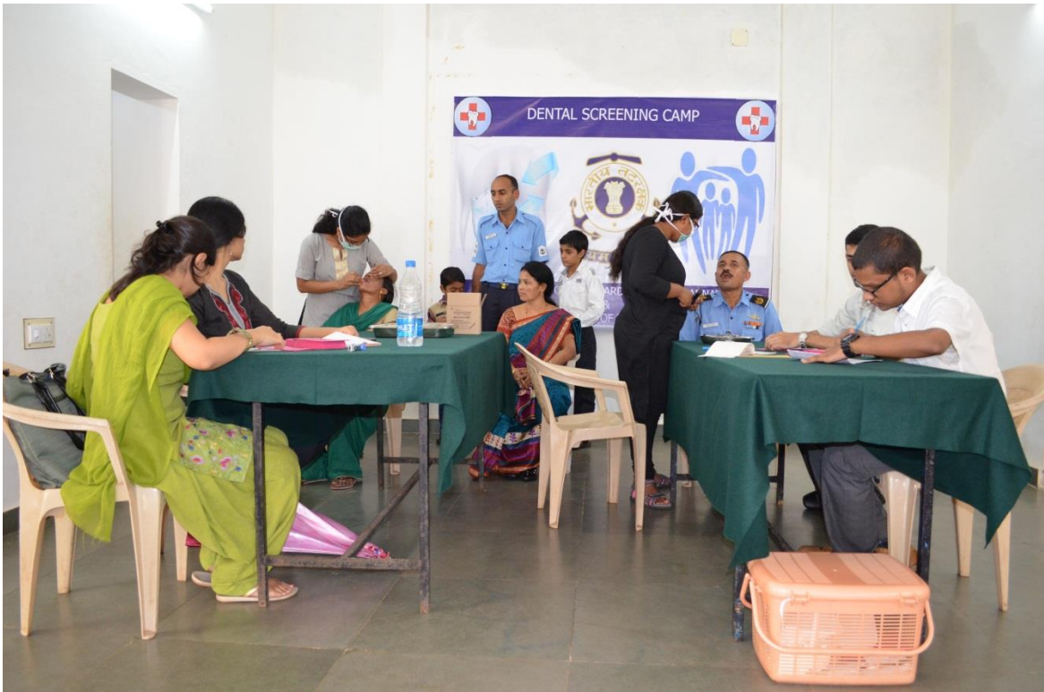
Community Outreach Program