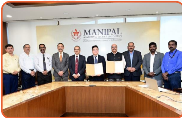
MOU signing between MAHE, Manipal and 3BIGS Co, Ltd, (Science and Technology)