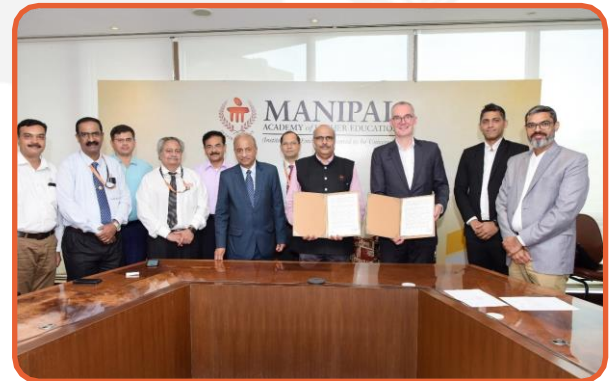
MOU signing between MAHE, Manipal and Novo Nordisk Service Centre (India) Private Limited, (Health Science)