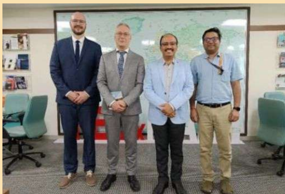
Erasmus University Medical Center, Netherlands