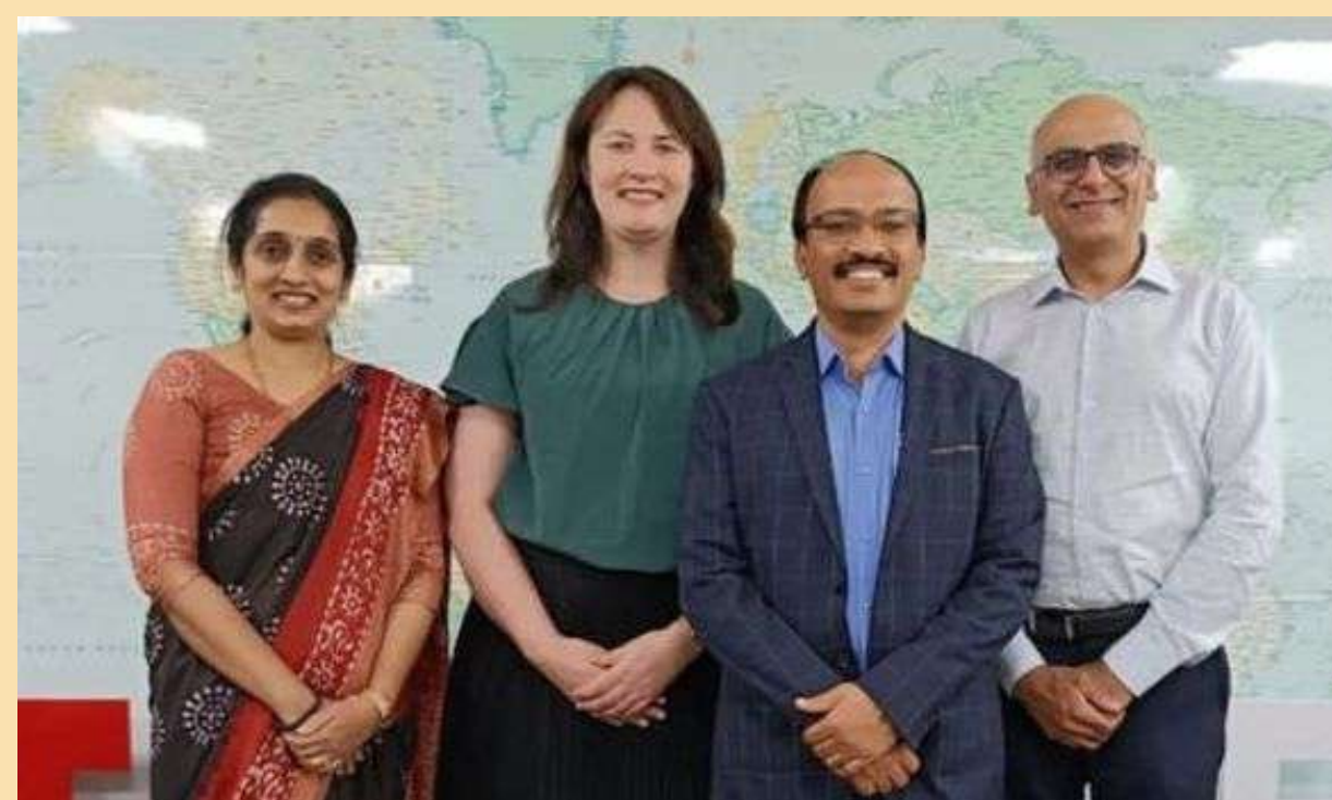
University of Melbourne, Australia