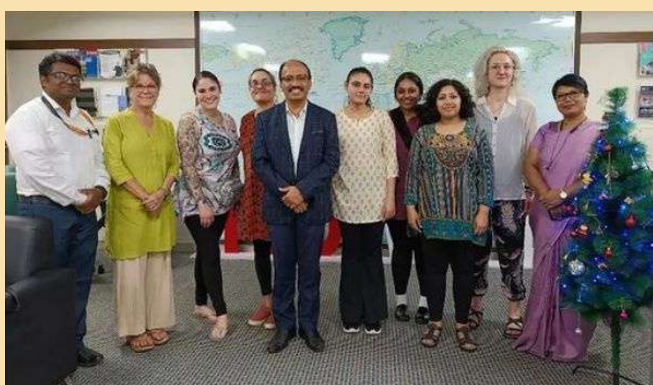
MGH Institute of Health Professions, USA