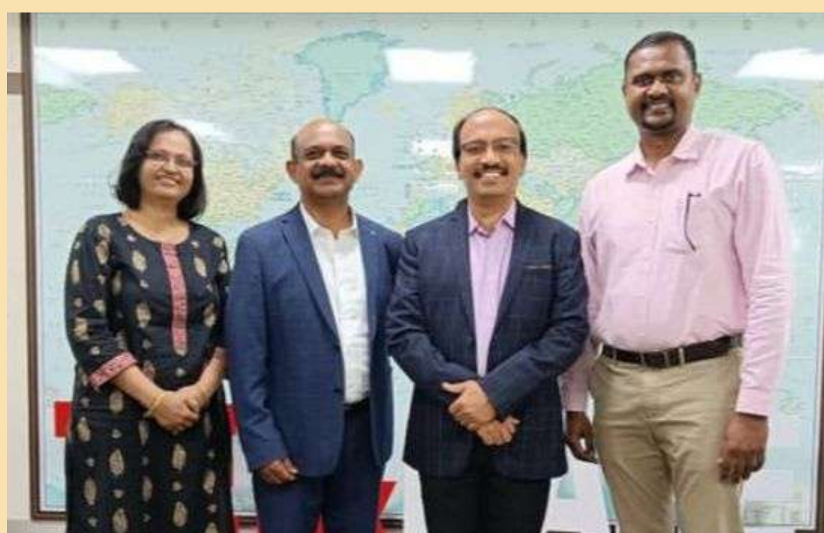
James Cook University, Singapore