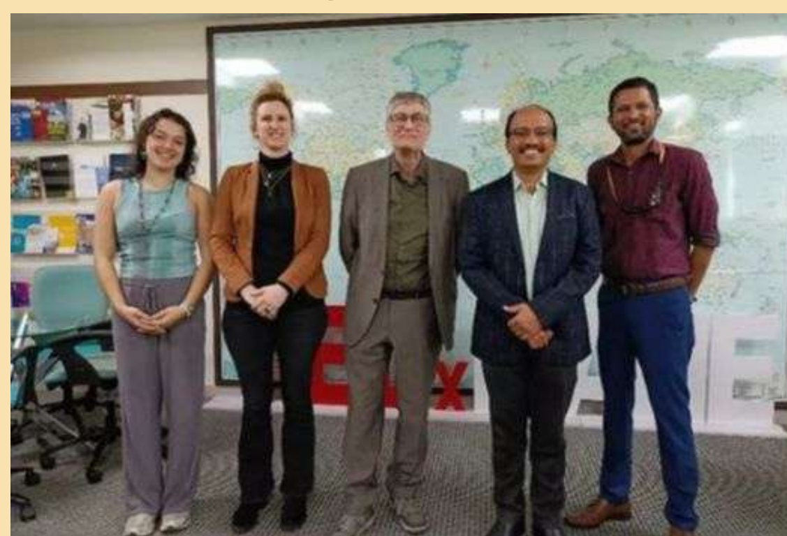
Hogeschool Utrecht, Netherlands