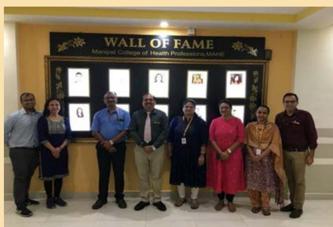
Georgia State University, USA