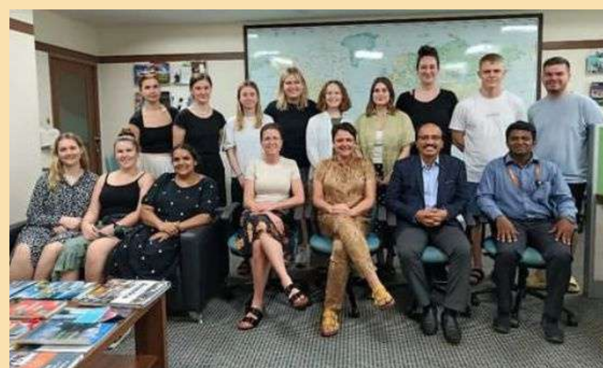
University College of Northern Denmark Denmark