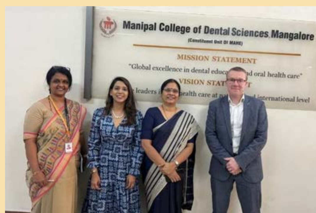
University of Portsmouth, England